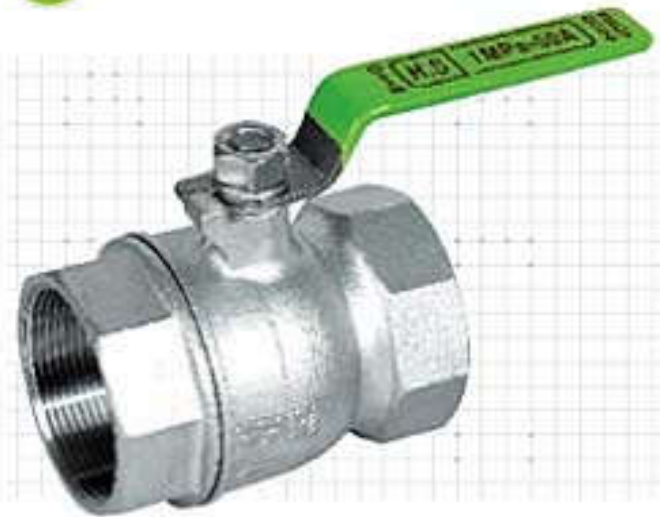
FIG 07-1 _ 용도 및 사용압력 : 물10kg/cm 2